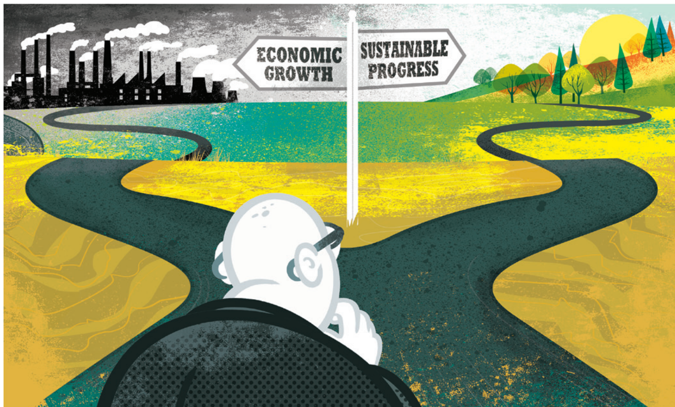
ILLUSTRATION BY PETE ELLIS/DRAWGOOD.COM

FUNDING Grant applications should feature multimedia presentations p.291