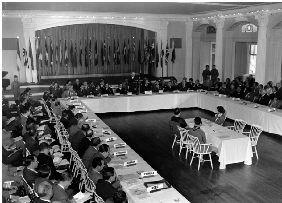
Bhutan has measured citizens' well-being using gross national happiness since 2008 (left); GDP has been in use since the 1944 Bretton Woods meeting (right).

of the 2012 Rio+20 UN Conference on Sustainable Development agreed to by all UN member states.